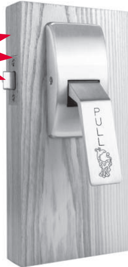
Optional Round Cover & Custom Engraving Shown

Optional "Q" Quiet Latch available - Zero decibels gained when operating the handles. Patent(s) pending.